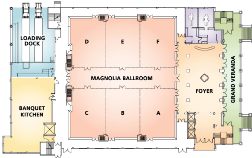
THE BAYTOWNE CONFERENCE CENTER - MAIN LEVEL