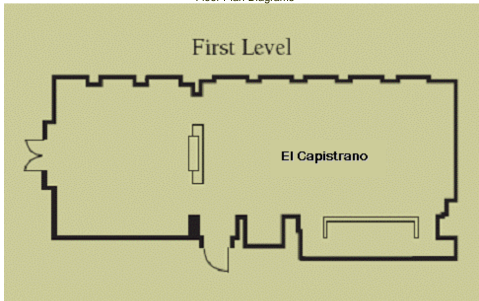
Floor Plan Diagrams